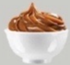
Dulce de leche