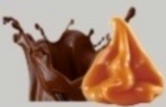
Chocolate / Caramel sauce