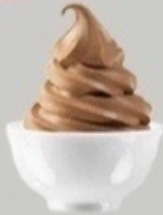
Chocolate custard cream