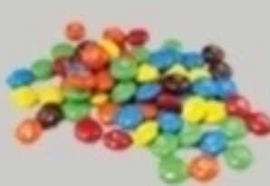
M & M's