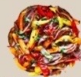
Roasted peppers & onions